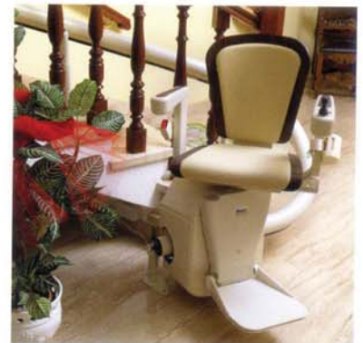
Seat rotation to ensure smooth unloading.