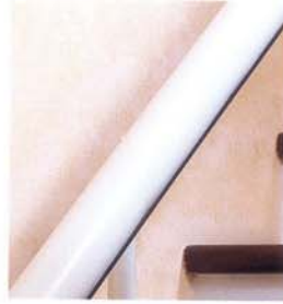
Cream white - Standard