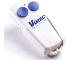
Remote control for floor selection